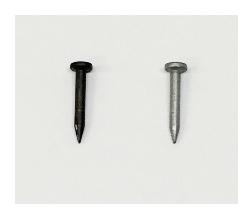
FIGURE 2—TRAKFAST FASTENER