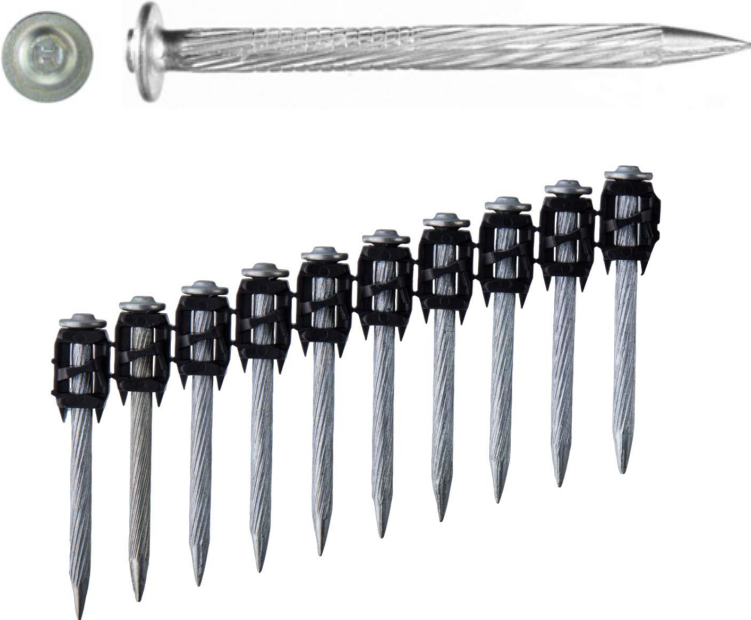
FIGURE 2—HILTI X-PN 37 B4 MX FASTENERS