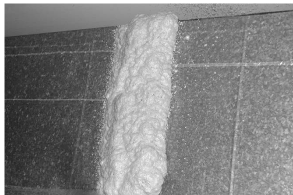
FIGURE 1—DUCT JOINT SEALING

1 R-values are based on tested k -values at 2-inch thickness.