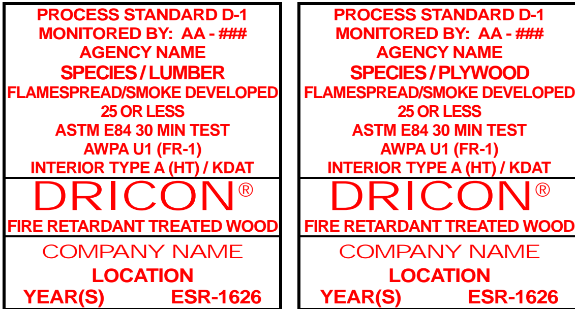
FIGURE 1—LUMBER AND PLYWOOD STAMPS 1,2,3