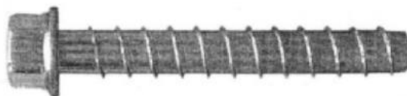
FIGURE 1—TYPICAL HD SCREW ANCHOR

Titen HD screw anchor packaging is marked with the Simpson Strong-Tie Company name; product name (Titen HD); anchor diameter and length; and the evaluation report number (ESR-1056). In addition, the ≠ symbol and anchor length (in inches) is stamped on the head of each screw anchor.