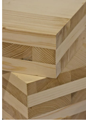
FIGURE 2—TYPICAL 3-PLY and 5-PLY OK LAMINATORS CLT PANEL LAYUPS