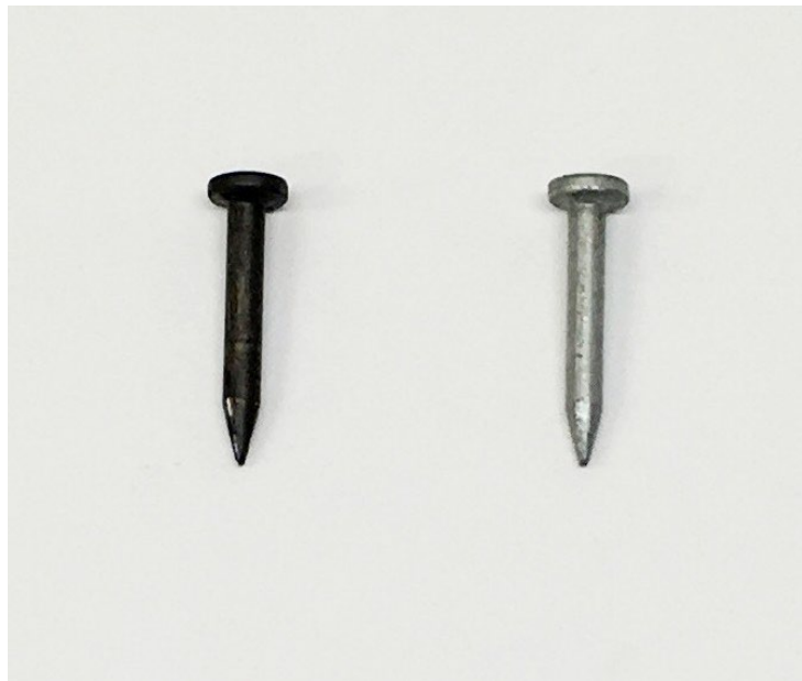
FIGURE 2—TRAKFAST FASTENER