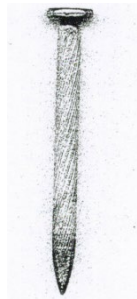
a. Knurled Shank Pin