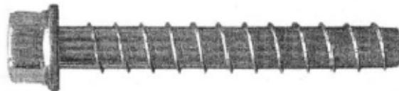
FIGURE 1—TYPICAL TITEN HD SCREW ANCHOR

Titen HD screw anchor packaging is marked with the Simpson Strong-Tie Company name; product name (Titen HD); anchor diameter and length; the name or logo of the inspection agency (CEL Consulting); and the evaluation report number (ESR-1056). In addition, the ≠ symbol and anchor length (in inches) is stamped on the head of each screw anchor.