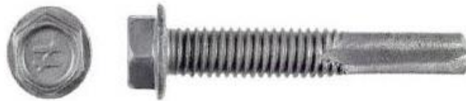
Example of X Metal Screw