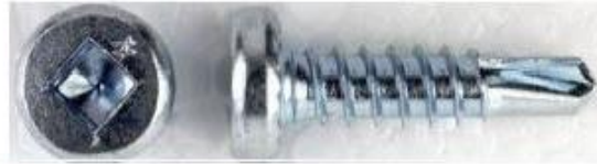
Example of FPHSD Framing-to-Cold-Formed Steel Screw