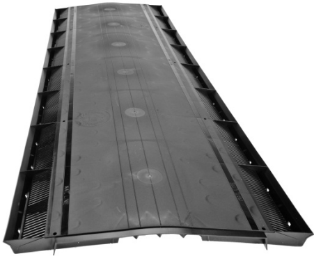
FIGURE 3—OMNIRIDGE® OR-4