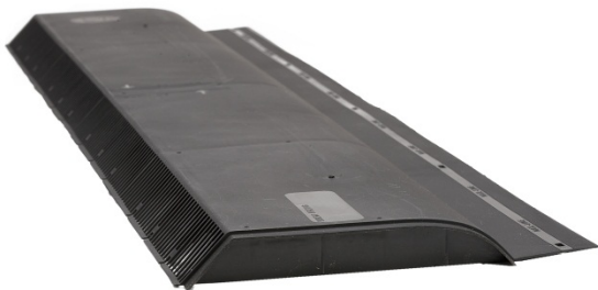
FIGURE 5—TILEINTAKE® VENT IV-9