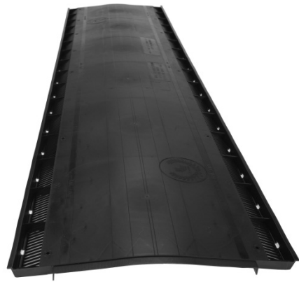
FIGURE 2—LO-OMNIRIDGE® LOR9-4