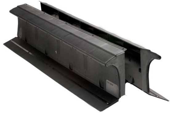
FIGURE 4—TILERIDGE® TRV-4