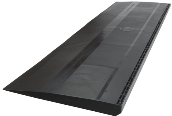
FIGURE 6—DECK-AIR® DA-4